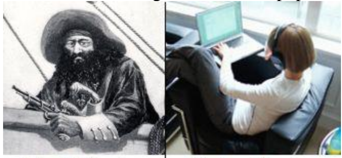
Real Pirate Fake Pirate

The difference being, if we sum it up, pirates are cool and you are not.